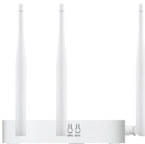
Figure 3-2 Right Panel of the ZXHN F680