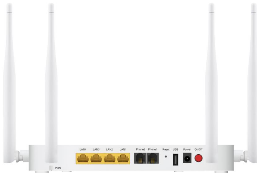
Table 3-1 Specifications for the Interfaces and buttons on the rear panel