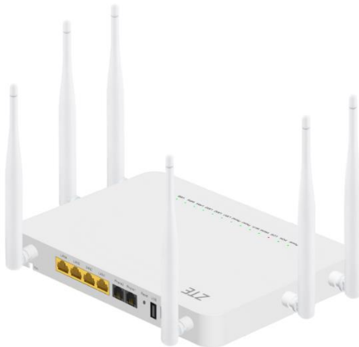
Figure 1-1 ZXHN F680 Housing Design

The ZXHN F680 is an ITU-T G.984 and ITU-T G.988 compliant optical network terminal (ONT) that is designed for high-end home users. It is well suited to fiber to the home (FTTH) scenarios and supports desktop mounting. At the network side, it supports 2.488 Gbps downlink and 1.244 Gbps uplink. At the user side, it provides four GE ports, two POTS ports, one USB 2.0 port, and 2x2 802.11n@2.4GHz & 4x4 802.11ac@5GHz concurrent. Figure 1-1 shows the housing design of the ZXHN F680: