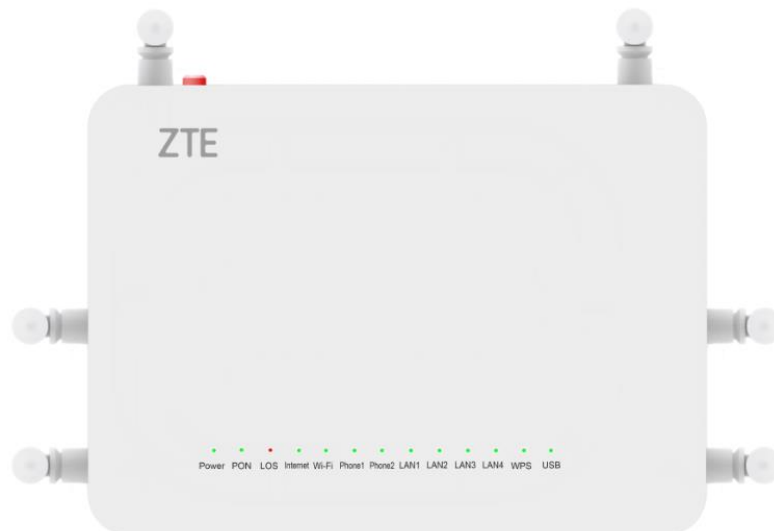
Table 3-3 Specification for the LED Indicators of the ZXHN F680